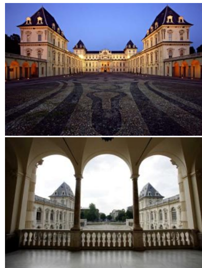
Pic. 1:

The Valentino is also one of the 22 structures of the UNESCO Site "Residences of the Royal House of Savoy". The study of this area and the design of a temporary light installation art would be part of the enhancement actions that are compulsory for the structures inscribed in the WHL.