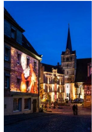
Pic. 2: Kronach Leuchtet 2015 - two installation examples and a video mapping.