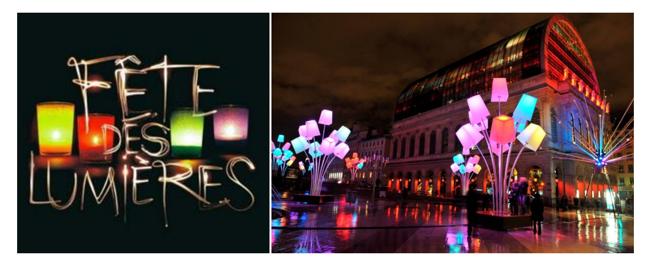
Pic. 3, from left: Fête des Lumieres logo; artistic installation Fête des Lumieres, Lyon 2012.

- "The design through the hands": the participants will be engaged in the construction and in the assembly of a prototype work of the winning design. At the same time, they will be involved in the organization of an exhibition useful to the disclosure of the results: the prototype will be shown in that occasion. (one week, January 2016)