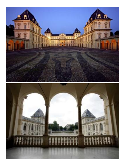
Pic. 1: pictures by castellodelvalentino.polito.it

The Valentino is also one of the 22 structures of the UNESCO Site "Residences of the Royal House of Savoy". The study of this area and the design of a temporary light installation art would be part of the enhancement actions that are compulsory for the structures inscribed in the WHL.